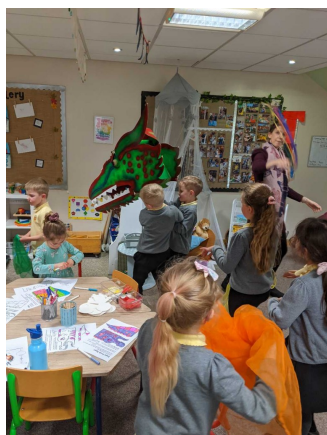
Chinese New Year Tasting Chinese food and praying for the Nation of China

We have had some wonderful learning opportunities this term and I would like to share a few photos below. Thank you for supporting our events and working in partnership with us, we really value the contributions you make to our school.