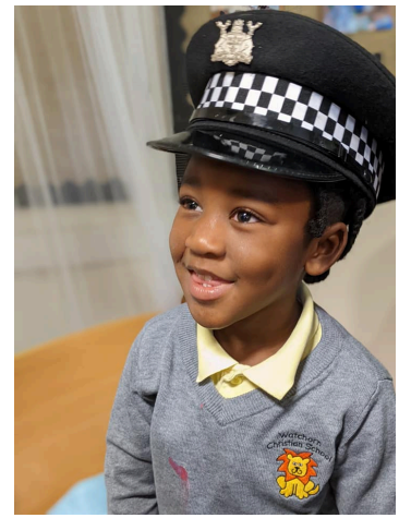
Internet Safety day